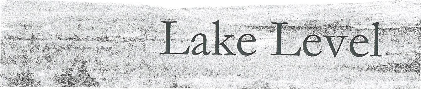
Keuka Lake Water Level