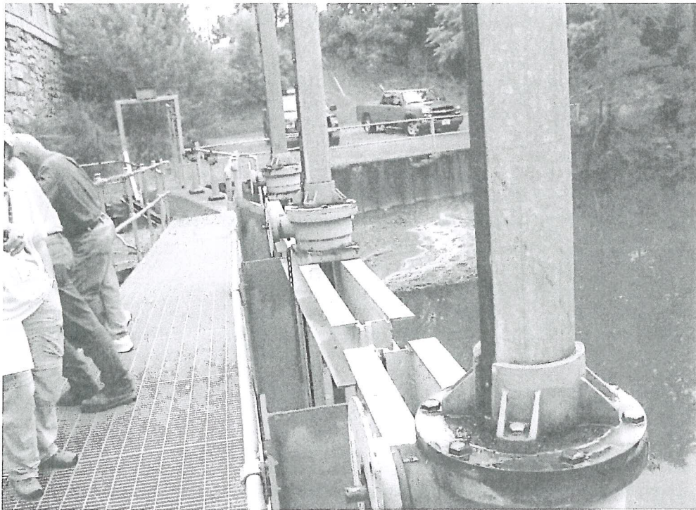
Photo 3 Gate Operators